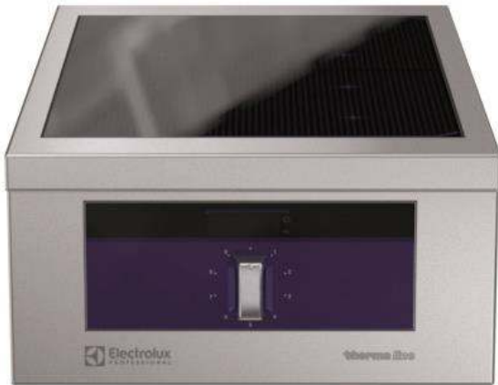
588014 (MACBACDOAO) Infrared top, 2 zones, two-side operated